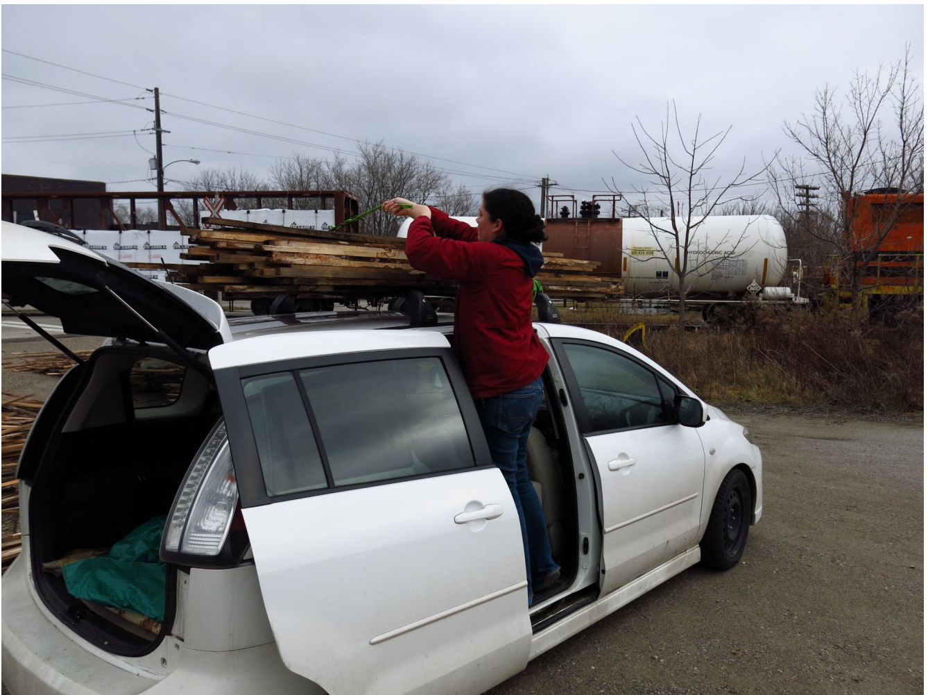
Helping to collect free lumber, on the other hand, is an altogether different story.

Look deep enough into the role and you may find yourself paying seminar fees for a beginner who really needs to go to a seminar, or perhaps you'll find yourself in court, posting bail. You may find yourself being a marriage counselor or a math tutor. What you should not expect to see, is students buying you beer, painting your house or cleaning your garage.