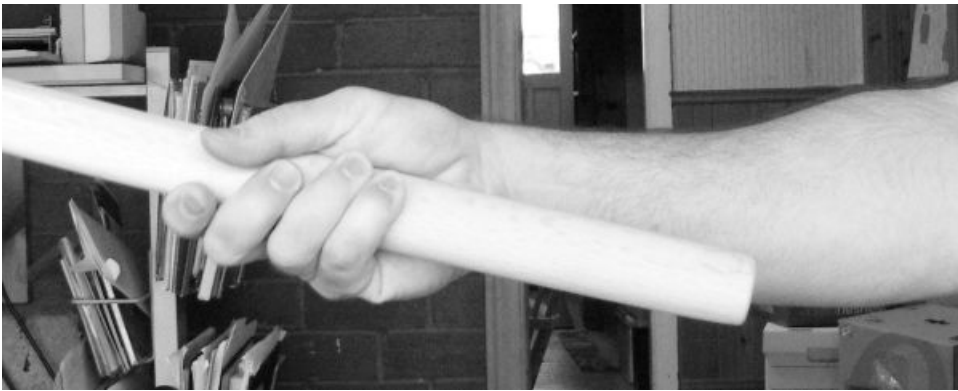
fig 5. for comparison, here is a one handed grip using the two-handed position across the palm.

In this last shot take note of how the wrist turns off to the side of the hilt naturally. To hit with this grip would mean that the blade would not be lined up with the arm and a lot of power and speed would be lost trying to keep the edge on line by torquing the forearm. The more square grip puts the wrist directly over the hilt.