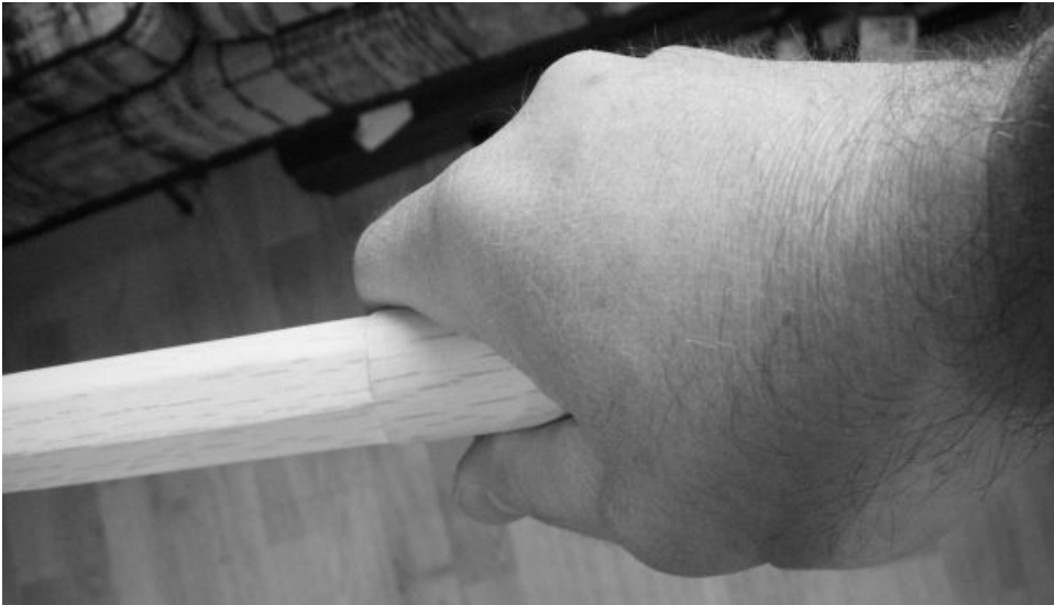
fig 7. This is the "straight thumb grip" that I recommend for one handed grips. The thumb falls straight down the side of the hilt, in line with the edge of the blade. You can see that this grip again pulls the wrist over the hilt and puts the forearm in line with the edge.