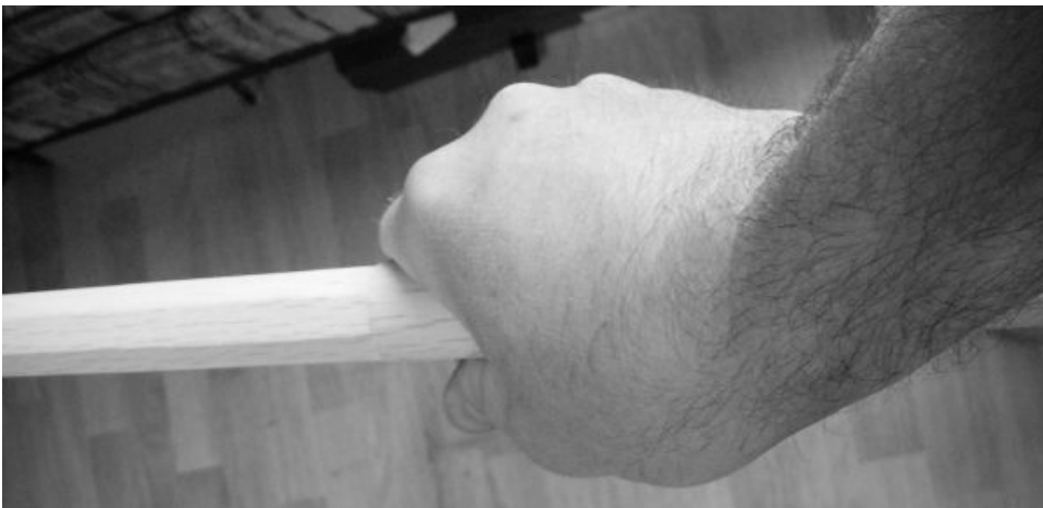
fig 9. Shibori

When it comes to the actual strike we may want to pull up with the thumb, into the palm as we also tighten the index finger. This is especially tempting with one handed strikes but as you can see in fig 8 above this will tend to twist the edge offline and roll the hand inward where it may even collapse. By squeezing the thumb sideways rather than pulling upward as in figure 9 we see that the wrist again moves over the hilt and the edge of the blade stays on line.