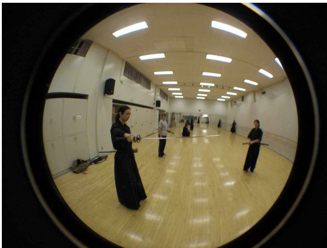
Look how big the old dojo was!

When you become thoroughly familiar with your tools and your art you will simply ask "what's the job?" and do it, even if it's something you have never done before. That's the true creativity of life-long experience. It's not finding a new way to do an old job, it's simply doing the job, new or old.