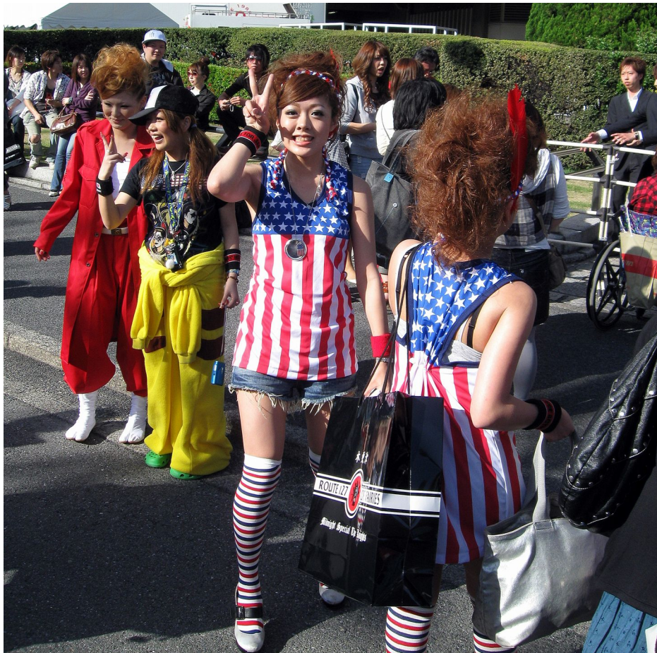
Outside the Nippon Budokan, 2009

The beginners will always believe that any Japanese has great skill in Budo, just as, I am sure, the "man on the street" in Tokyo believes Canadians know about hockey, Americans know about 6-guns and Europeans know about football. We should simply accept this and move on, confident that anyone of any nationality will eventually be skilled in our chosen arts if they continue to train for a couple of decades with good instructors, regardless of where they were born.