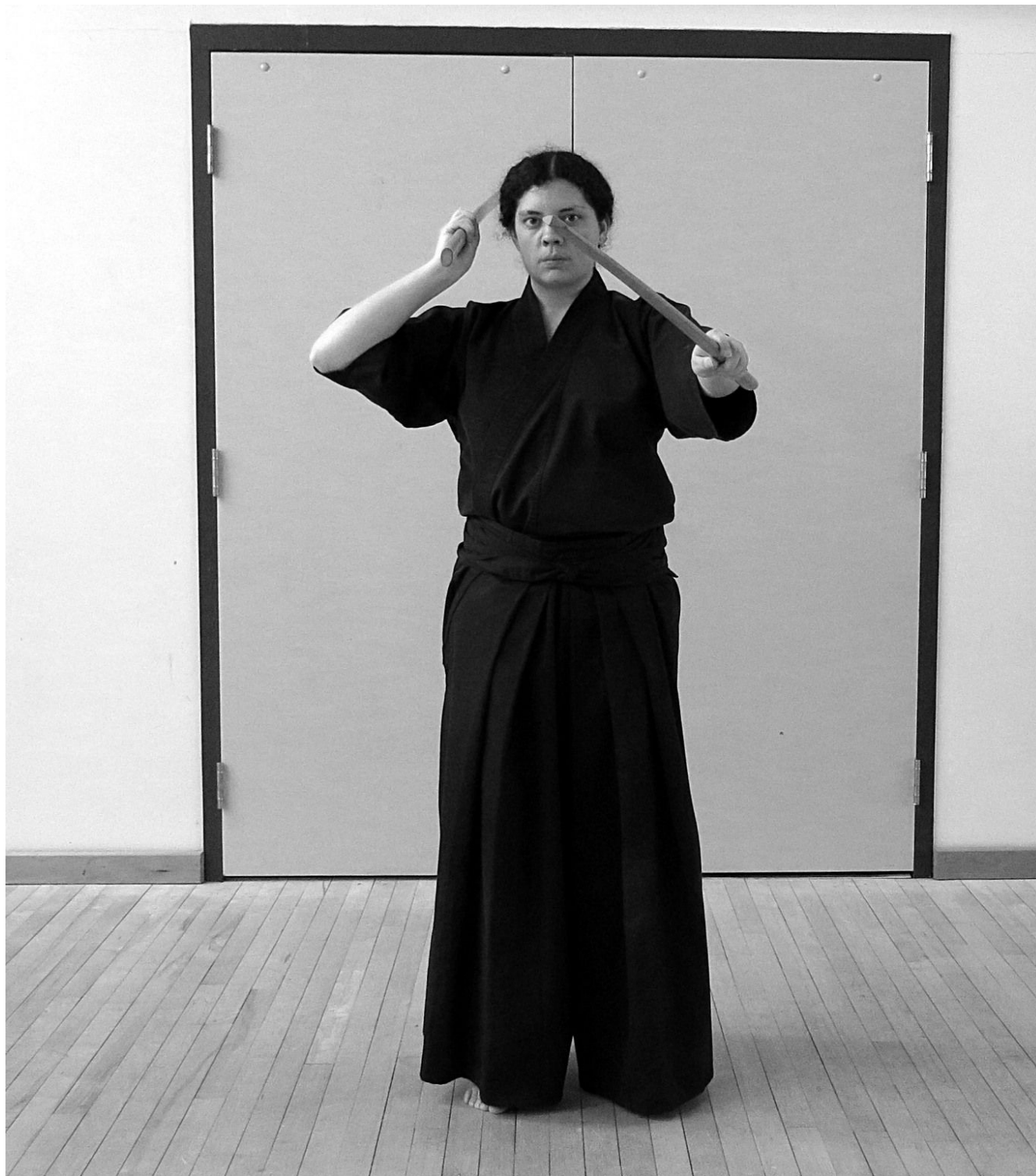
Niten Ichiryu, Nito Seiho, Jodan.

battlefield in a sword school, but that's not where the majority of artistic technique or sword kata are going to come from.