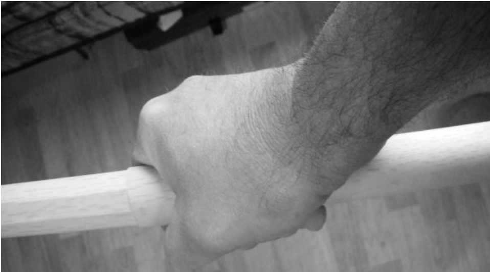
fig 8. Tenouchi