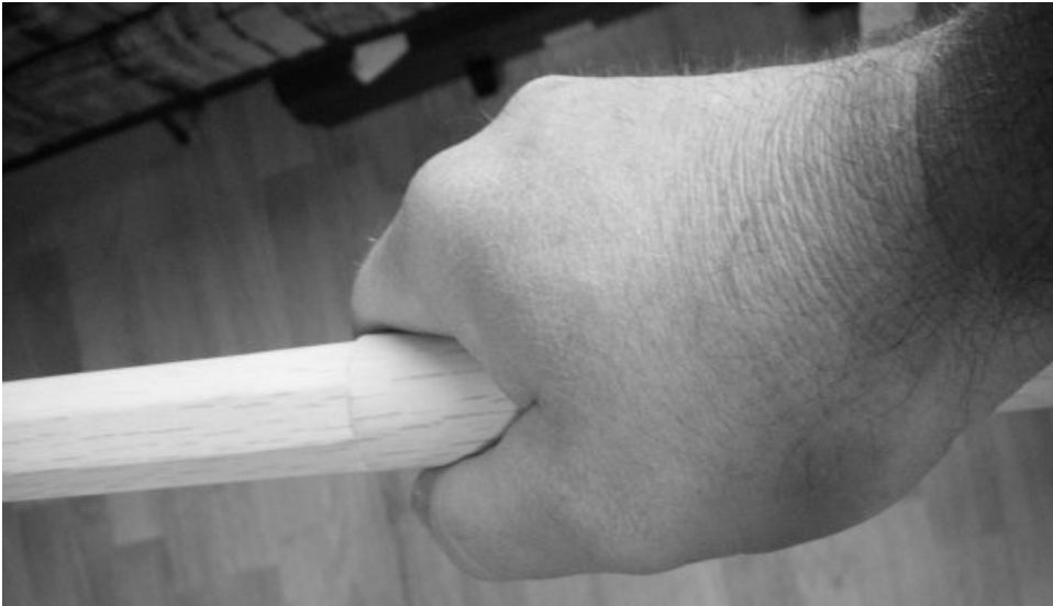
fig 6. This is the classical "ping pong ball" grip, whereby a ball would not fall off the hand if placed on top. I have seen this in books and heard it taught.