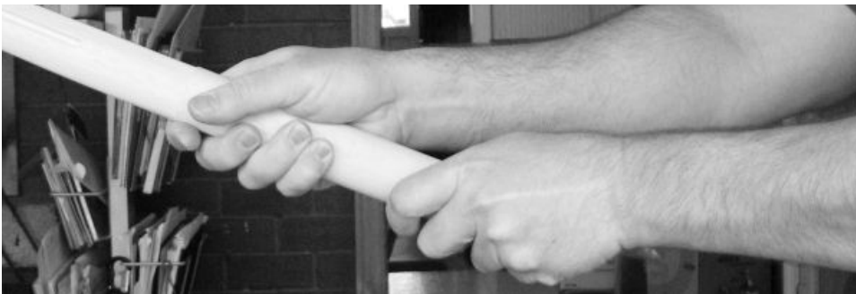
fig 1. two handed grip