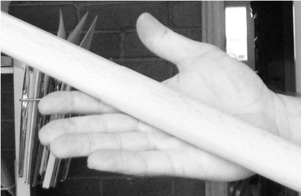
fig 2. angle on palm of two handed grip