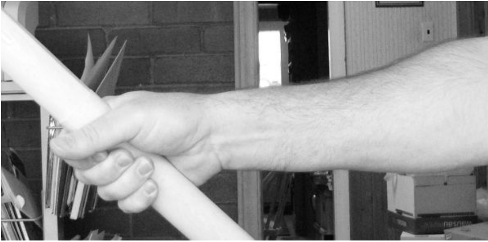
fig 4. one handed grip