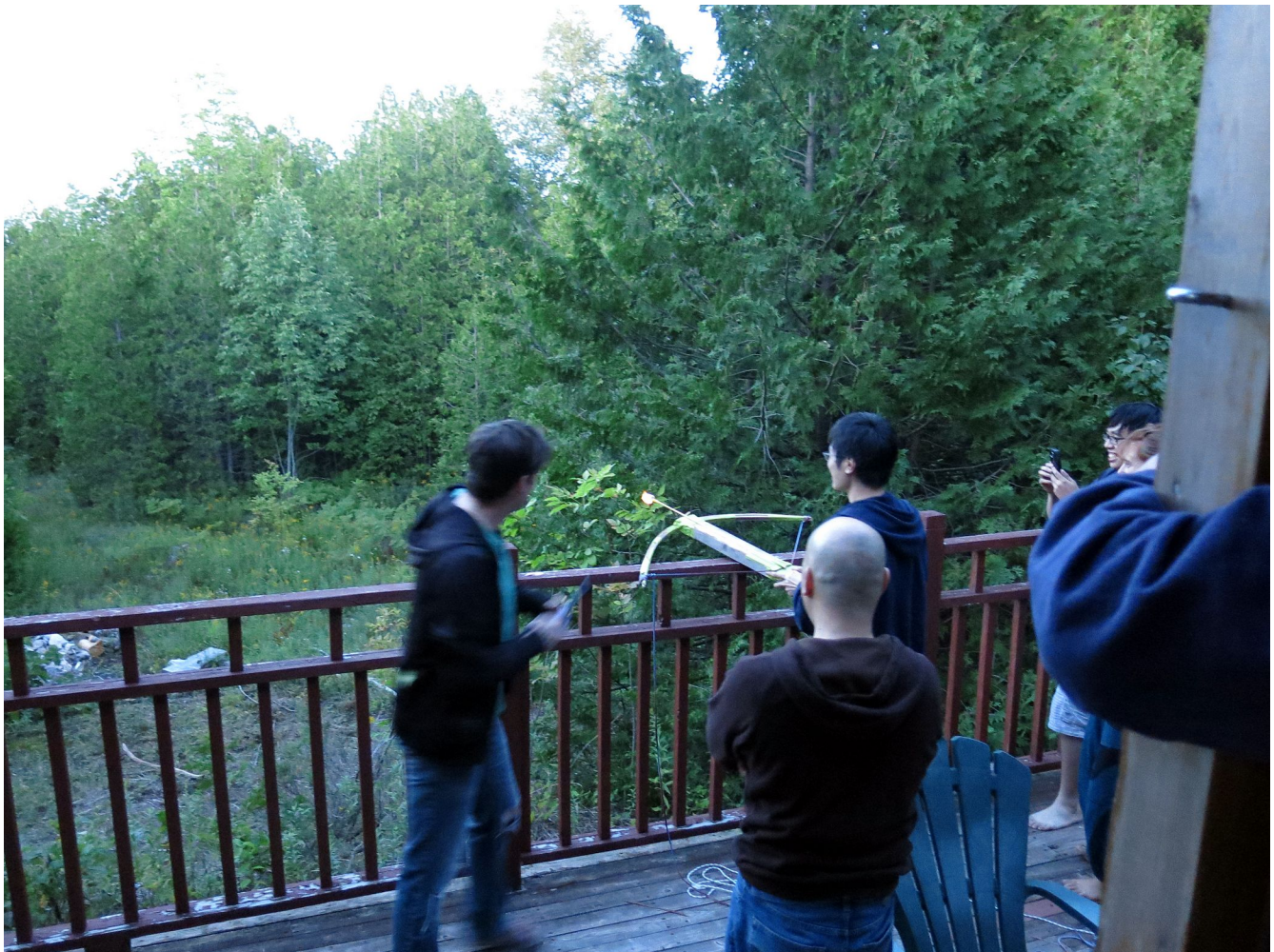
That's my students, flaming marshmallows off the deck.