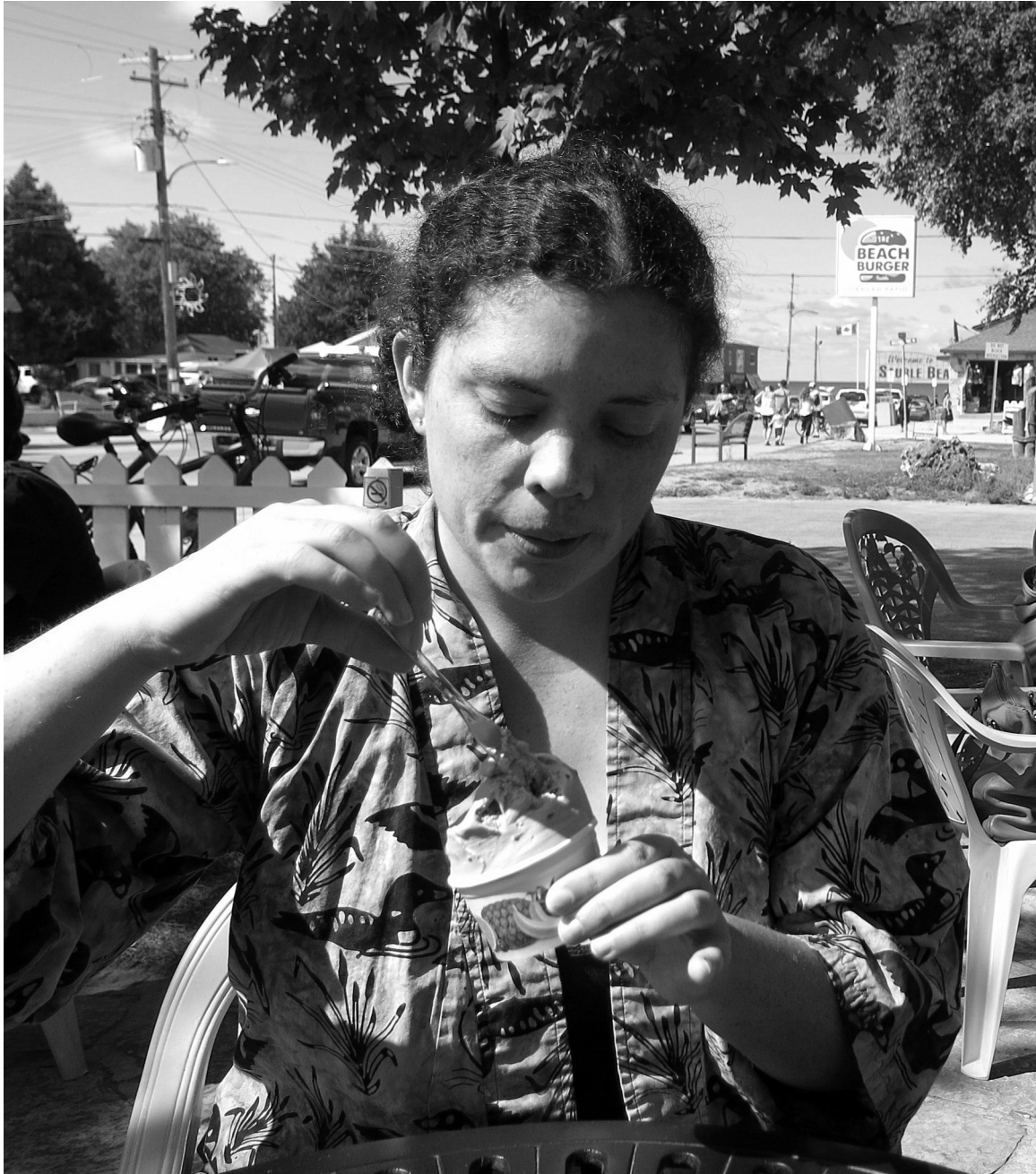
The Pamurai with a Gelato in Sauble Beach, you can't swing swords all the time.